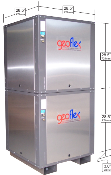
Model GF2A-180WW (360 Nominal)

A= 1.25" CSF - Loop In B= 1.25" CSF - Loop Out C= 1.25" CSF - Warm/Chilled Fluid In D= 1.25" CSF - Heated/Chilled Fluid Out NOTE: All water connections come standard with copper sweat fitting (CSF) but optional flnpt fittings can installed, upon request.